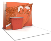
VIBE Kit 02

Quickwall is a versatile, fast and portable solution to easily create a 10' graphic back wall. Quickwall includes three retractable banner stands and a durable, adjustable banner stand carry case. An added bonus is that all components can be used separately, adding to this system's versatility and convenience.