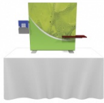
Linear Tabletop Kit 3

Orbus' new series of Linear Monitor Kiosks add function and flare to any space. LCD/Plasma screens are supported with extrusion-based construction and are coupled with rigid graphic infill panels or frosted plex panels for a unique messaging opportunity.