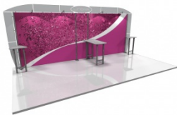
Linear Pro & Standard Kits

The new line of Linear Tabletop displays feature tension fabric center graphics, are lightweight and take minutes to assemble. The tabletop displays provide a modern and dynamic flare and are available in four styles. Customized units are also available.